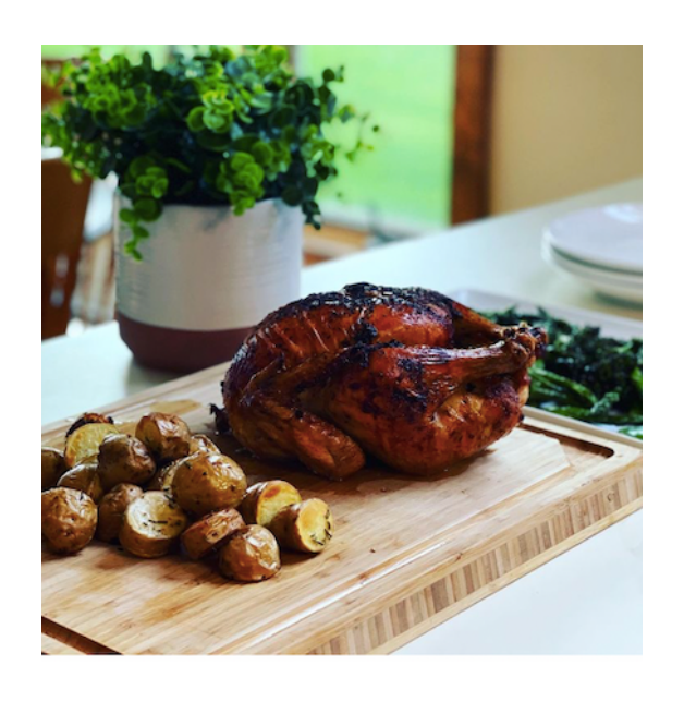
Non-GMO Pasture Raised Whole Chickens Available As shown

This is a great way to stock your freezer for fall